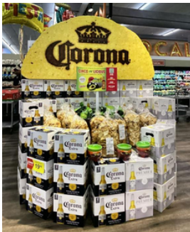
MARKET STREET #674 | MIDLAND