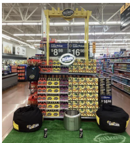
WALMART 1041 | WESLACO