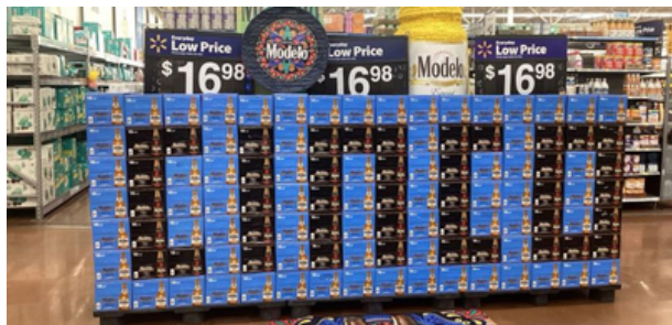
WALMART 1041 | MCALLEN