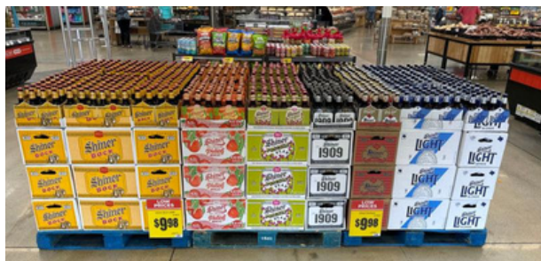
HEB FOOD STORE #092 | VICTORIA