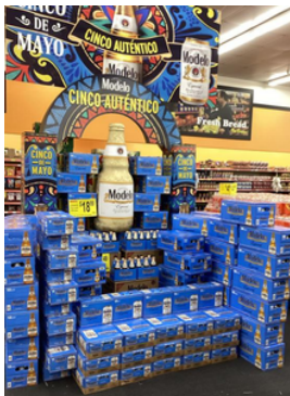
LOWE'S MARKETPLACE #37 | ODESSA