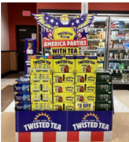
FAMILY FARE #3799 | OMAHA