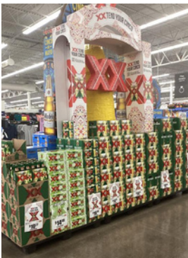
WALAMRT 0601 | SAN ANGELO