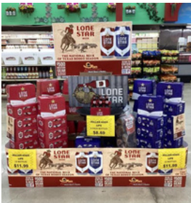
LA FIESTA #3 | SAN ANTONIO