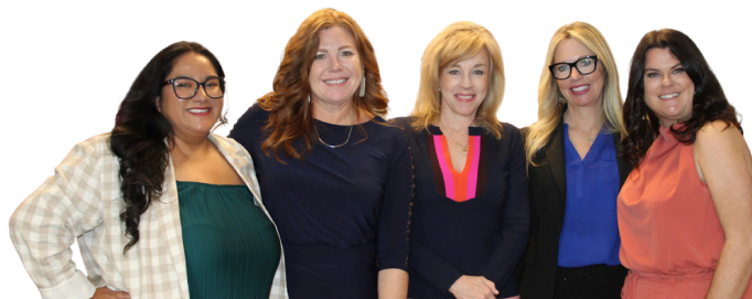
Sip N' Chat - Women's History Month: 03/27/24

Leadership guidance is invaluable, especially for those stepping into supervisory roles. Panelists emphasized the importance of skills such as active listening, ongoing education, and the ability to adapt to changing circumstances. These principles provide a roadmap for emerging women in leadership. The mentor-mentee relationship is highlighted as a cornerstone for growth, offering skill enhancement, learning from seasoned professionals, and opening doors to advancement opportunities.