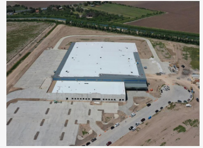
Weslaco Development: 09/20/23